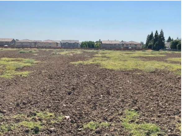
Photograph 2, Same Viewl Facing East, July 21, 2023