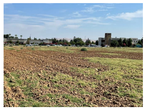
Photograph 4, View Facing North, July 21, 2023