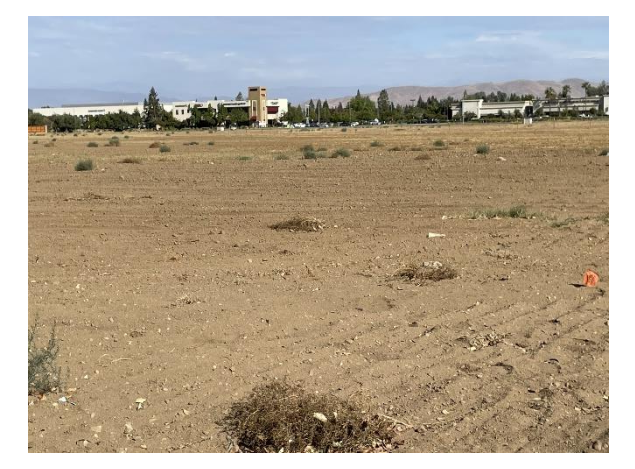
Photograph 3, View Facing North, September 13, 2022